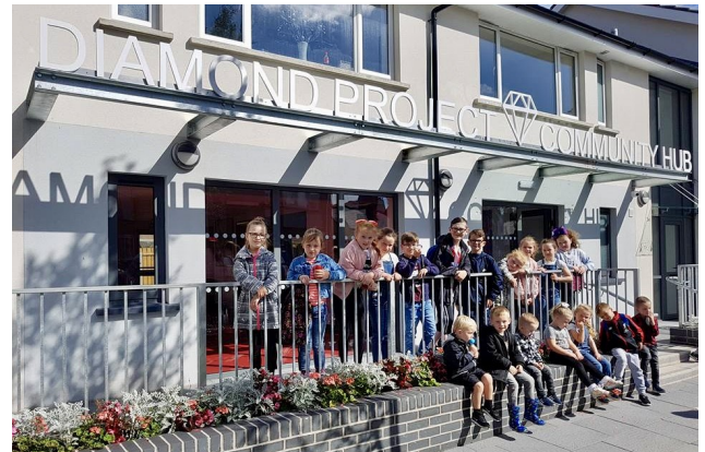
Neighbourhood children gather at the new Diamond Project Community Hub building

While operational for a relatively short time, the project has delivered a number of visible successes, highlighting what can be achieved with a joined up, partnership approach."