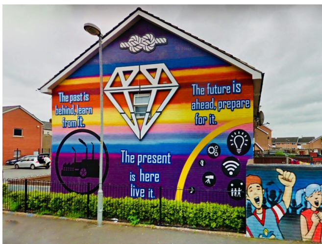
A new mural on Lord Street with a diamond theme replaces paramilitary imagery.

Key to the success of the project has been the re-imaging of the area in general but particularly the replacement of paramilitary murals in the area with others reflecting the communities' broader interests and concerns. This initiative, funded by the Housing Executive, gave the community confidence that processes could lead to change. The high point of the regeneration programme to date is the transformation of the streetscape through significant investment from the Department of Infrastructure.