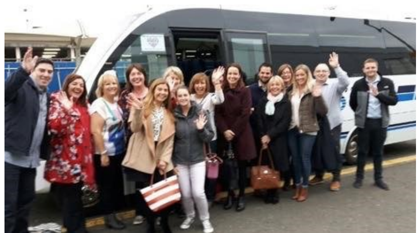
Empowering Communities Study Trip to Glasgow in 2017