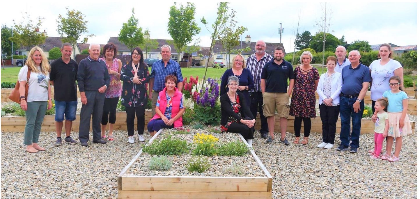
Launch day attended by Residents, Community Group Representatives, NI Housing Executive, Supporting Communities, Big Lottery Fund Officer, Causeway Coast & Glens Council and Ballycastle Gardening Services.