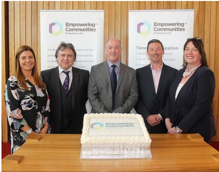
Celebrating the launch of Empowering Communities in April 2017

Since the launch of the new trading subsidiary last year at the Skainos Centre in Belfast, Empowering Communities has been busy providing support, advice, and training to our new members and other stakeholders.