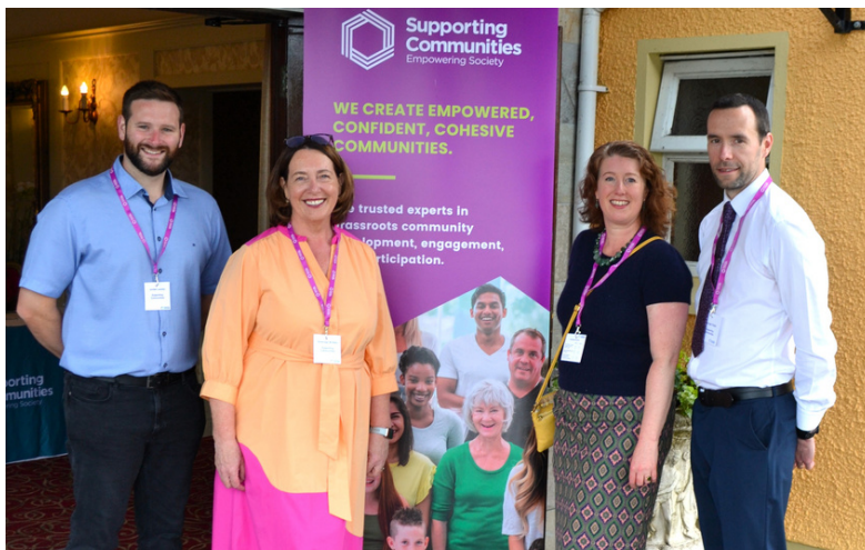
Supporting Communities staff get ready for the big day!