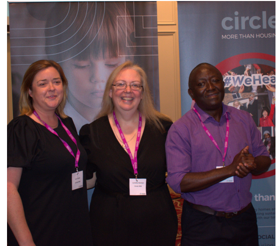
Circle staff and tenants who spoke at the conference

and the chairman of An Garrán Residents’ Association in Tramore, provided some plainspoken wit and wisdom about what makes a community and how his little corner of the world had welcomed newcomers from all over and built a happy, cohesive community for all.