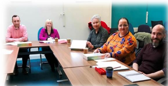
D4C representatives meet to discuss Phase 2 of the project

Supporting Communities will deliver the training and empower participants to access a variety of online services such as emailing, social media, shopping, banking and the NIHE website/app. A focus of sessions will be Universal Credit and aiming to provide the participants with the necessary skills to apply for the new benefit, as well as maintain and update their personal accounts. As part of the project, a social aspect of the meetings and classes emerged from Phase 1 and we hope to continue this interacting and socialising among participants as well as staff members through a relaxed atmosphere.