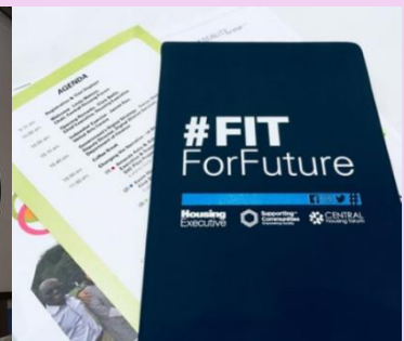
This year's event looked to the future of community engagement and the increasingly digital world in which we live