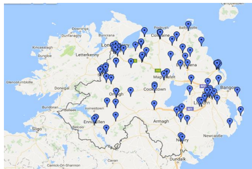
Training Locations since Sept 2012

38 Mi-Fi Routers distributed by Supporting Communities throughout N Ireland