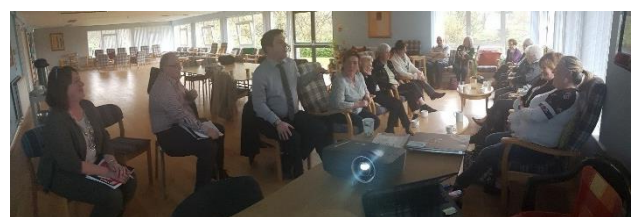
Newington Housing Association staff and tenants at information meeting facilitated by Supporting Communities looking at benefits of establishing Tenants Forum