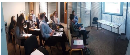
Staff from Fold North West Office receiving Tenant Participation & Community Development Training