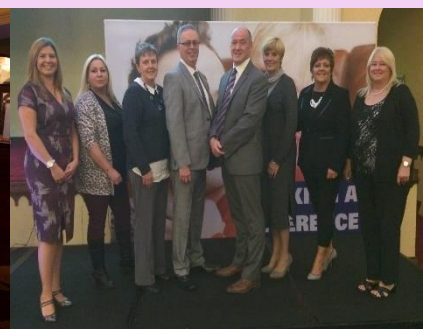
Members of the Community Conference Working Group