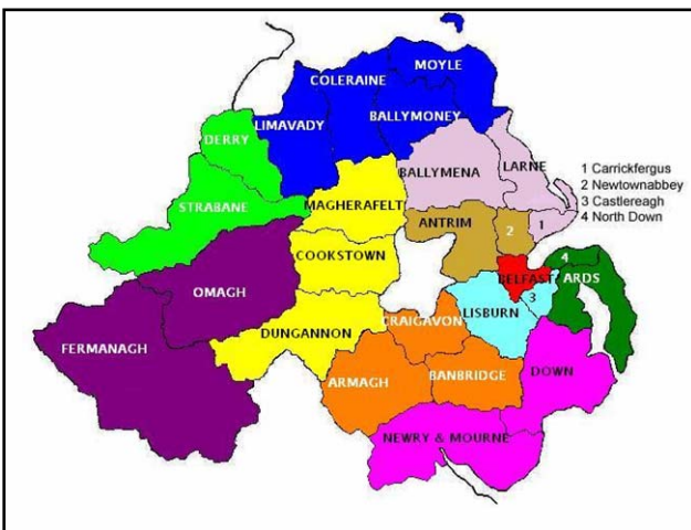
11-Council model for Northern Ireland

The map below outlines the general amalgamation of existing councils into the new 11-council model, with the final decisions on the exact boundaries to be taken by the Boundary Commissioner - an appointment to this role is expected by July 2008.