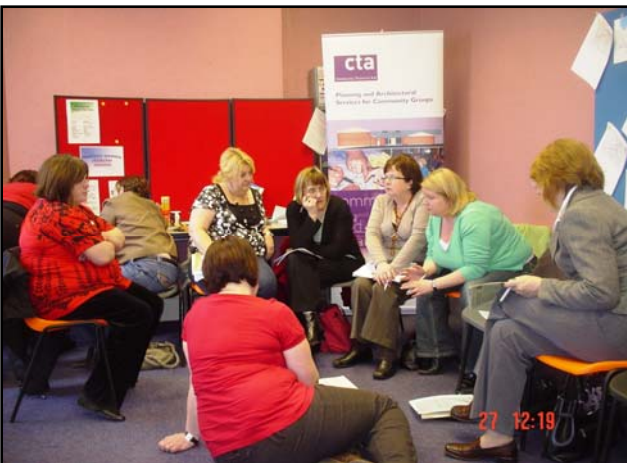
Craigavon Community Planning Workshop

The Project has provided a number of Information Events and Workshops in collaboration with networks including Craigavon Community Network, Coleraine Rural and Urban Network and East Belfast Community Development Agency and preparations are under way for the development of a local Community Plan in the Ards area.