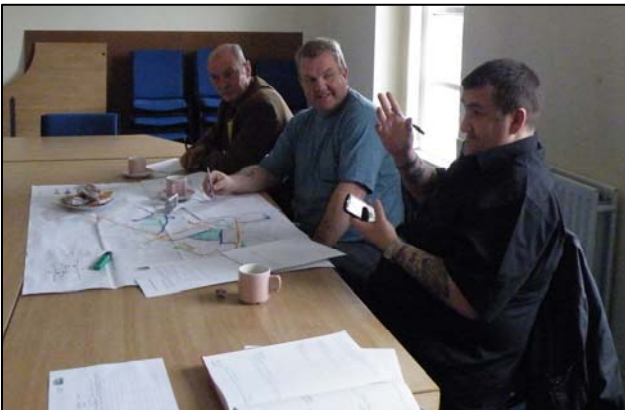
Scrabo Community Planning Workshop

With the new councils not expected to be in place until 2011, it is likely that several pilot schemes will be introduced to begin the process of Community Planning. It is hoped that new statutory guidelines on how to undertake community consultation will also be developed from these pilots.