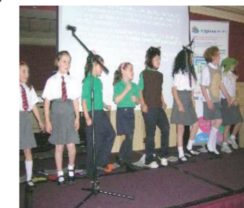
Children performing at the Conference

The 'Breathe Out' programme provides warm up games, breathing exercises and singing lessons for children from various backgrounds and meets on Saturday mornings in Cookstown Leisure Centre.