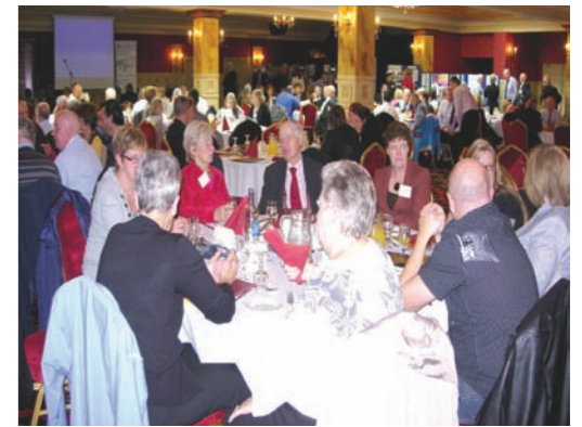
Above: Conference delegates represented Community Groups from across the province