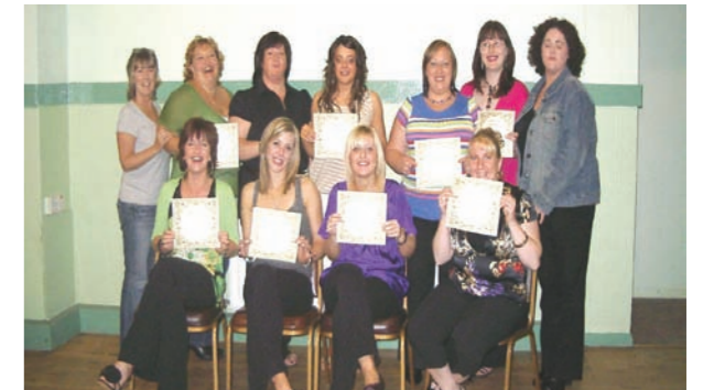
Above: Students with their Tutors at the presentation evening for Lenadoon Community Forum Training & Education Project's E.C.D.L. course